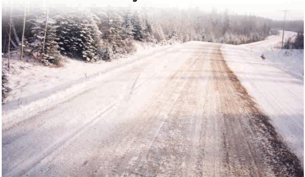
Pre-wet sand: one of the technologies MTO is testing to improve winter driving conditions.

N ow that winter is here, the Ministry of Transportation will be testing new innovations to improve the quality of service and reduce costs in maintenance operations. Road Talk highlights what's being evaluated for the 2004-2005 testing season. This season, testing is being done at selected locations in all five of MTO's Regions.